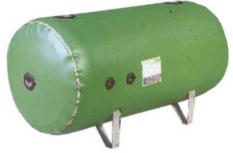
SKY INSULATION KIT